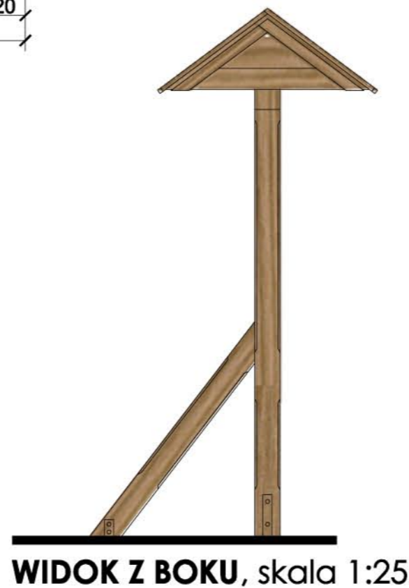
WIDOK Z BOKU, skala 1:25