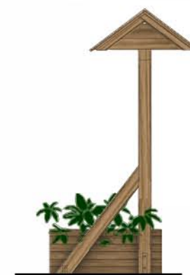
WIDOK Z BOKU, skala 1:50